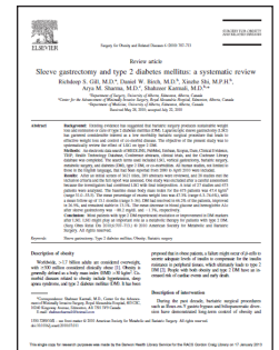
Gill et al. SOARD (2010); 6:707-713

Thus sleeve gastrectomy is a viable option for treatment of type II diabetes and obesity and in some cases may represent a lower risk approach than bypass.