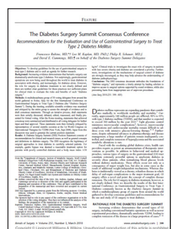
Rubino et al. Ann Surg (2009)

“A surgical approach may also be appropriate as a non-primary alternative to treat inadequately controlled T2DM in suitable surgical candidates with mild-to-moderate obesity (BMI 30–35 kg/m 2 ).”